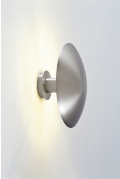
( B ) Disco medium