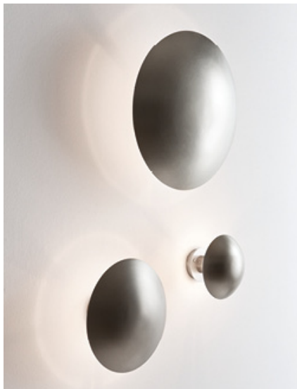
( A ) Disco small, ( B ) Disco medium, ( C ) Disco large

A steel disc hides the light source and diffuses it around the opaque circle. The light is reflected on the wall and creates a halo around the disc, rather like the luminescence of stars during an eclipse.