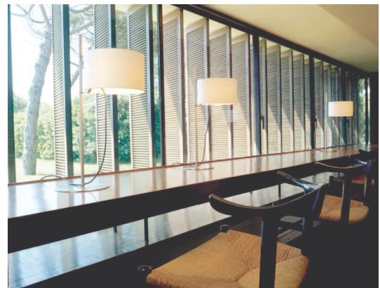
TMD Table lamp