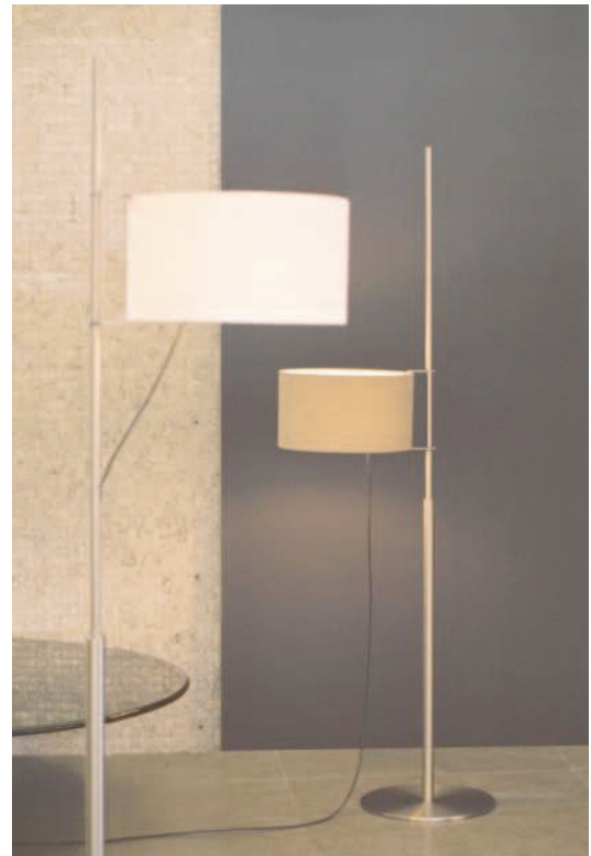
TMD Floor lamp

The assembly instructions are delivered with the product.