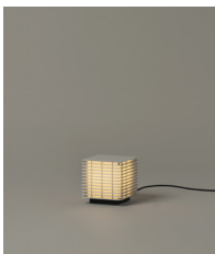
Shiro 17 Interior