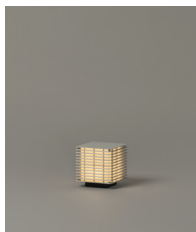
Shiro 17 Bateria