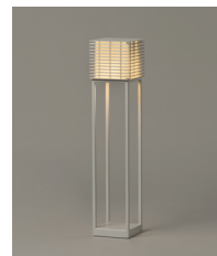
Shiro 17 Alta