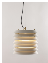
Maija 15 / 30