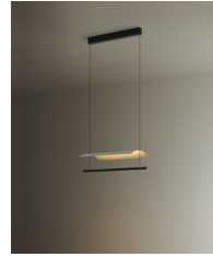
Lámina 45 / 85