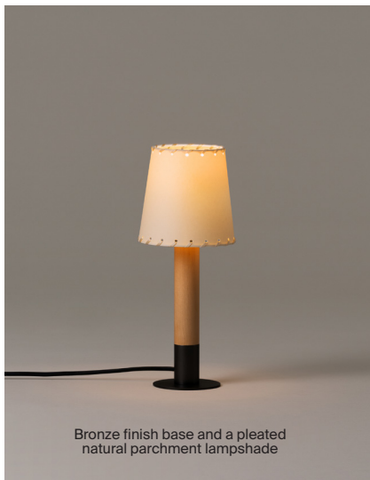
Bronze finish base and a pleated natural parchment lampshade

Santiago Roqueta, Santa & Cole Team. 1994 Table Lamps