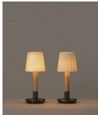
Básica Mínima Batería