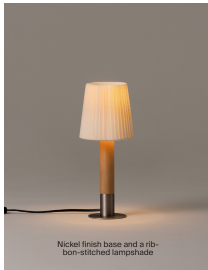
Nickel finish base and a ribbon-stitched lampshade