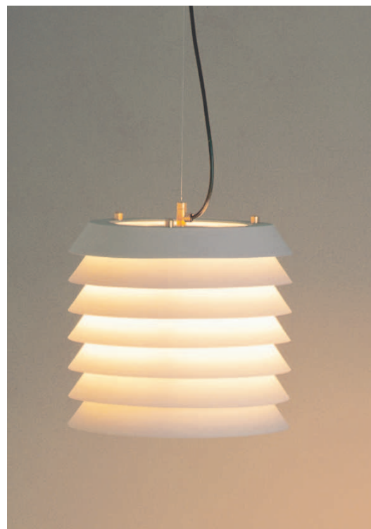
MAIJA hanging lamp