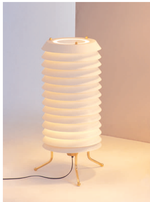
MAIJA floor lamp

The assembly instructions are delivered with the product.