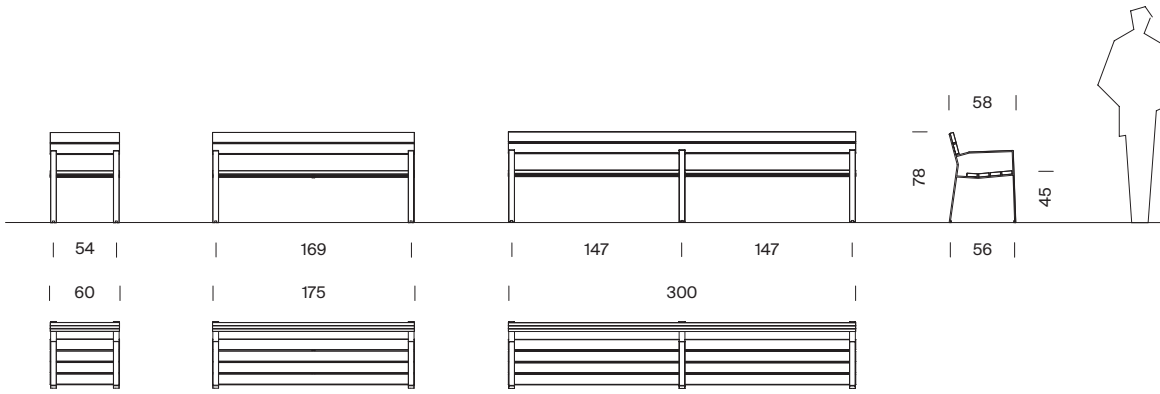
Bench Harpo 0.60m, 1.75 m and 3.00 m with arms