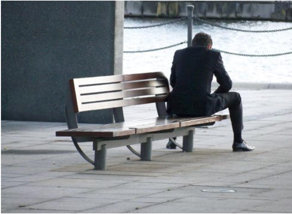
Project Royal Victoria Square (London)