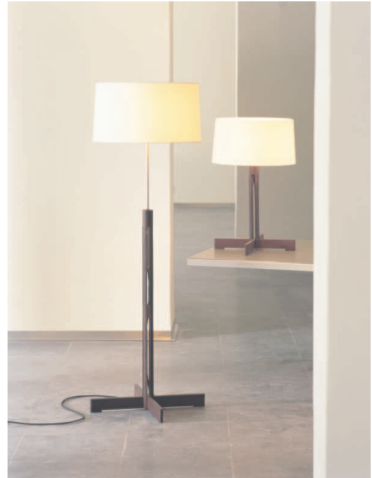
FAD table and floor lamp

Luminaries are delivered in different packets. The assembly instructions are delivered with the product. (2.) Height adjustable lampshade.