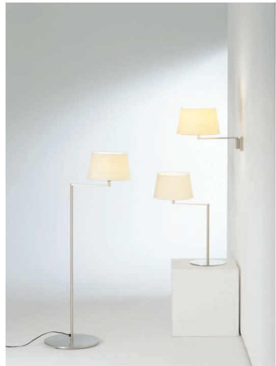
AMERICANA wall, table and floor lamps

The assembly instructions are delivered with the product.