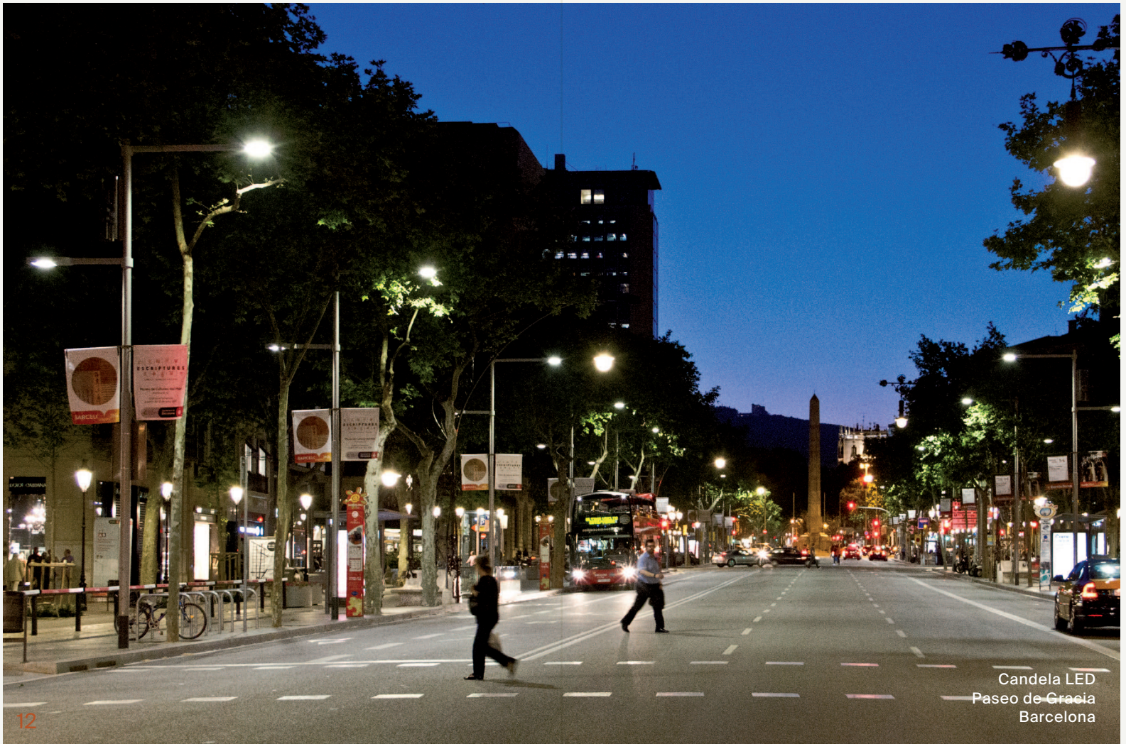
Candela LED Paseo de Gracia Barcelona