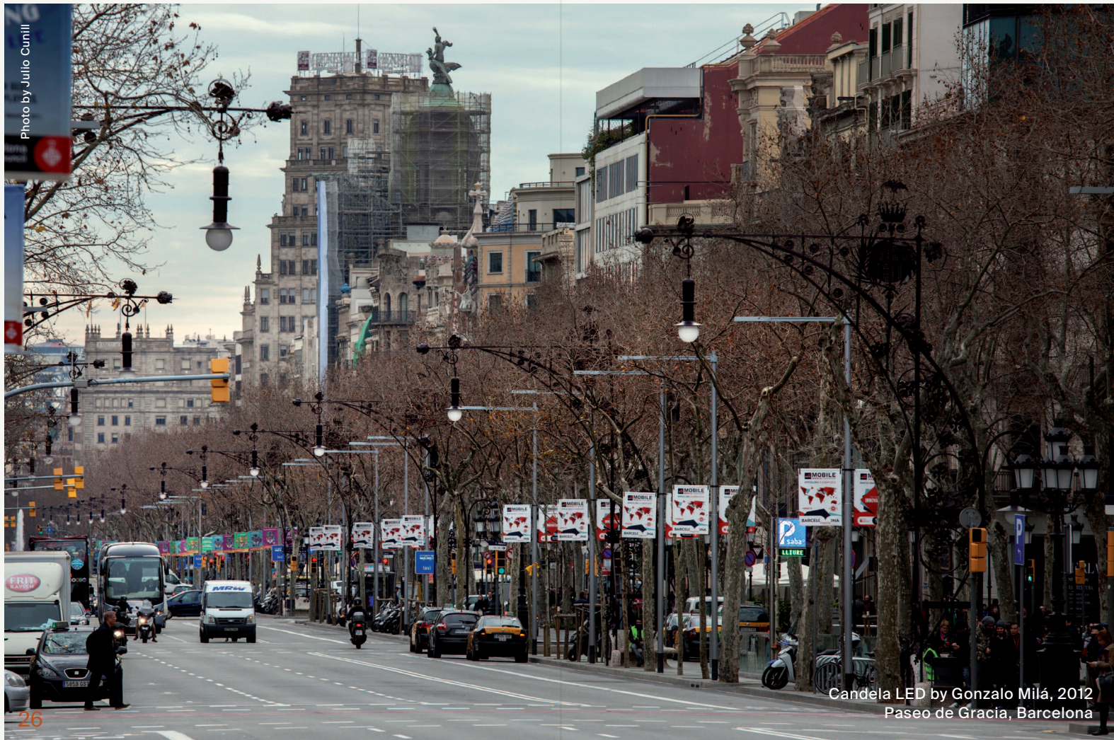
Candela LED by Gonzalo Milá, 2012 Paseo de Gracia, Barcelona