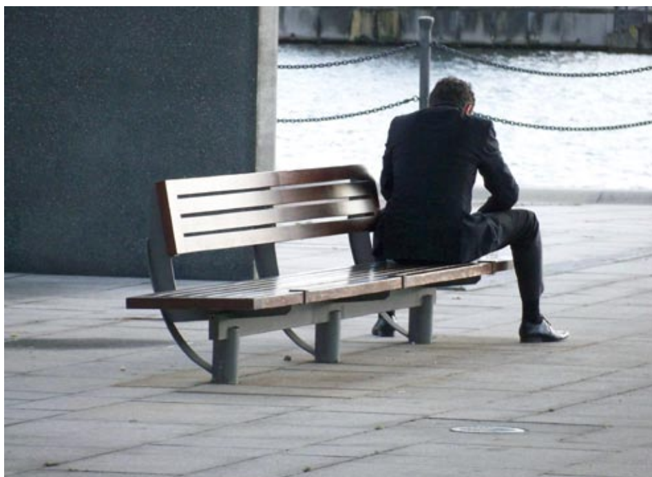
Project Royal Victoria Square (London)